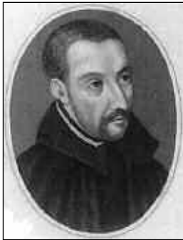
ST. ROBERT SOUTHWELL