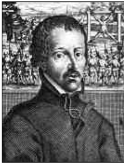
ST. EDMUND CAMPION