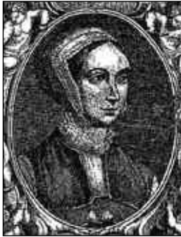
ST. MARGARET CLITHEROW